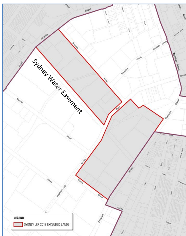
Figure 2: Land within the employment lands which is excluded from the Sydney LEP 2012

Sydney LEP 2012 excludes the land generally bound by McEvoy Street, Bowden Street, O'Riordan Street, the Sydney Water Easement and Perry Park. The excluded lands are shown at Figure 2. This land is currently subject to the South Sydney LEP 1998.